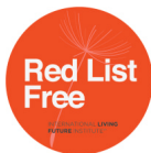
Declare® Red List Free